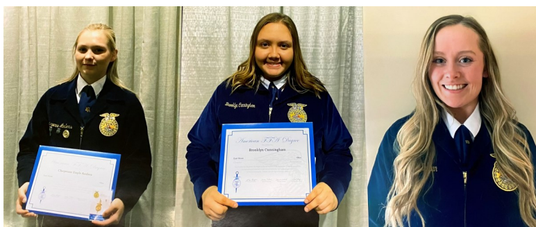
FFA American Degree 2021 Award Recipients